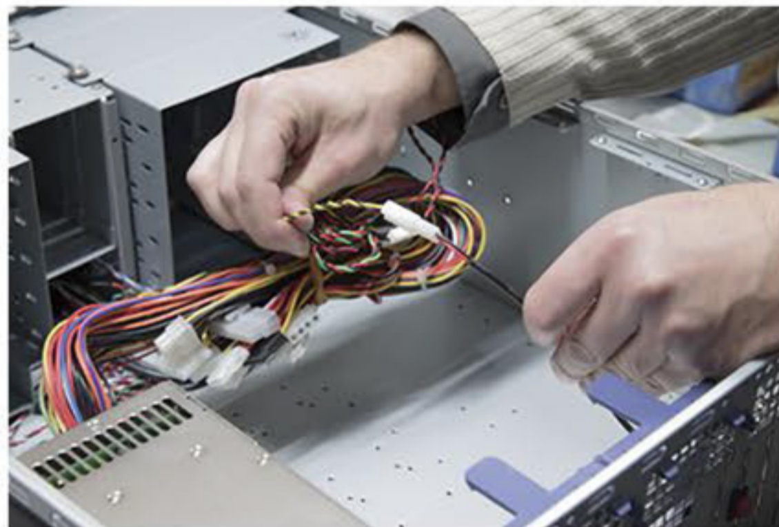
10. Connect the cable of the buzzer-reset button to the PSU.