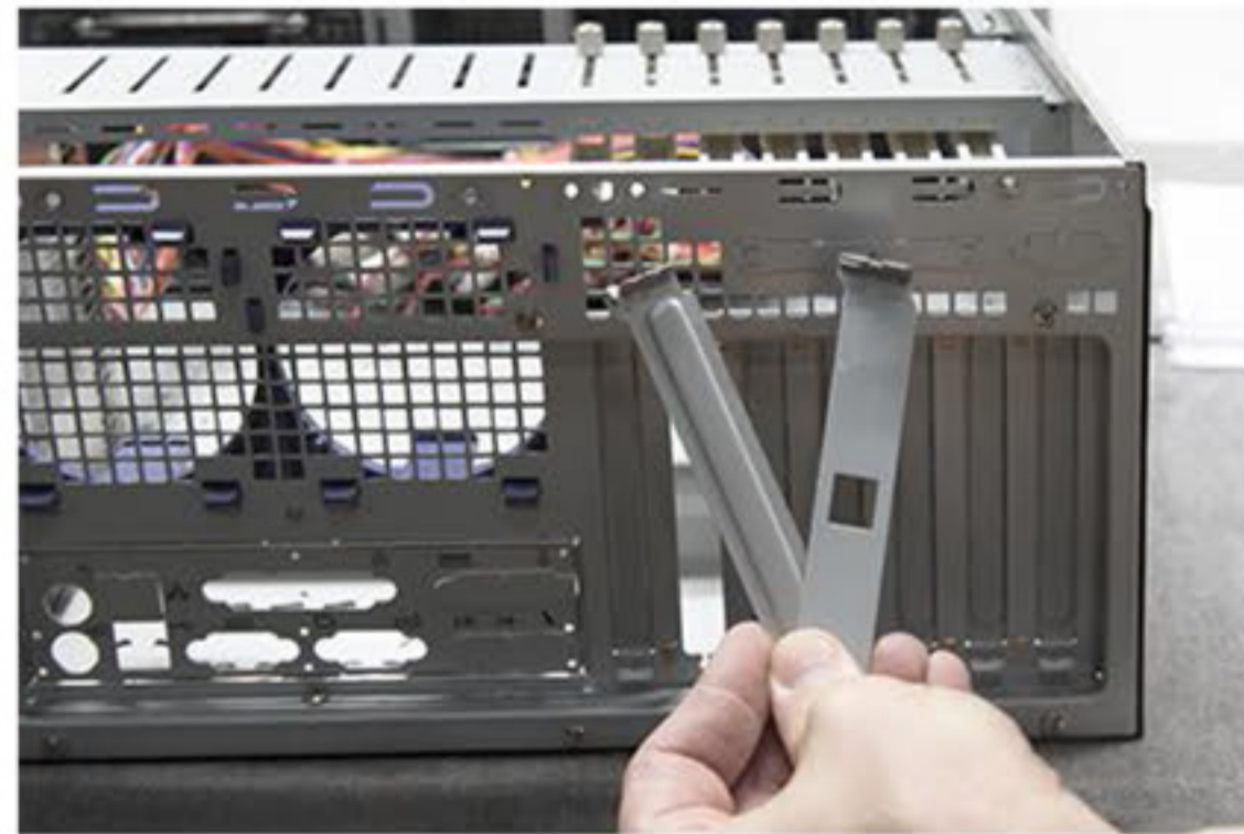
8. Exchange the standard PCI bracket with the PCI bracket with the buzzer-reset button hole.