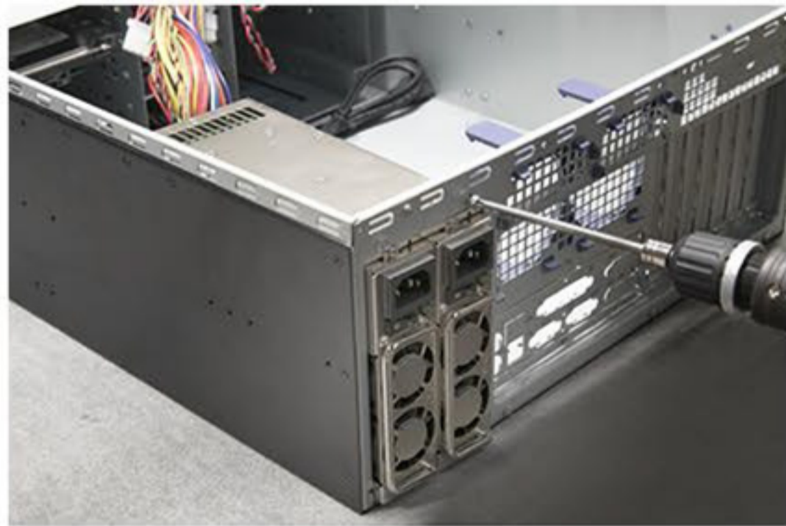
7. Use 5 screws to fix the PSU.