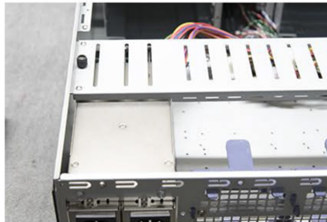
11. Re-Install the HDD cage in place, as shown in step 3.