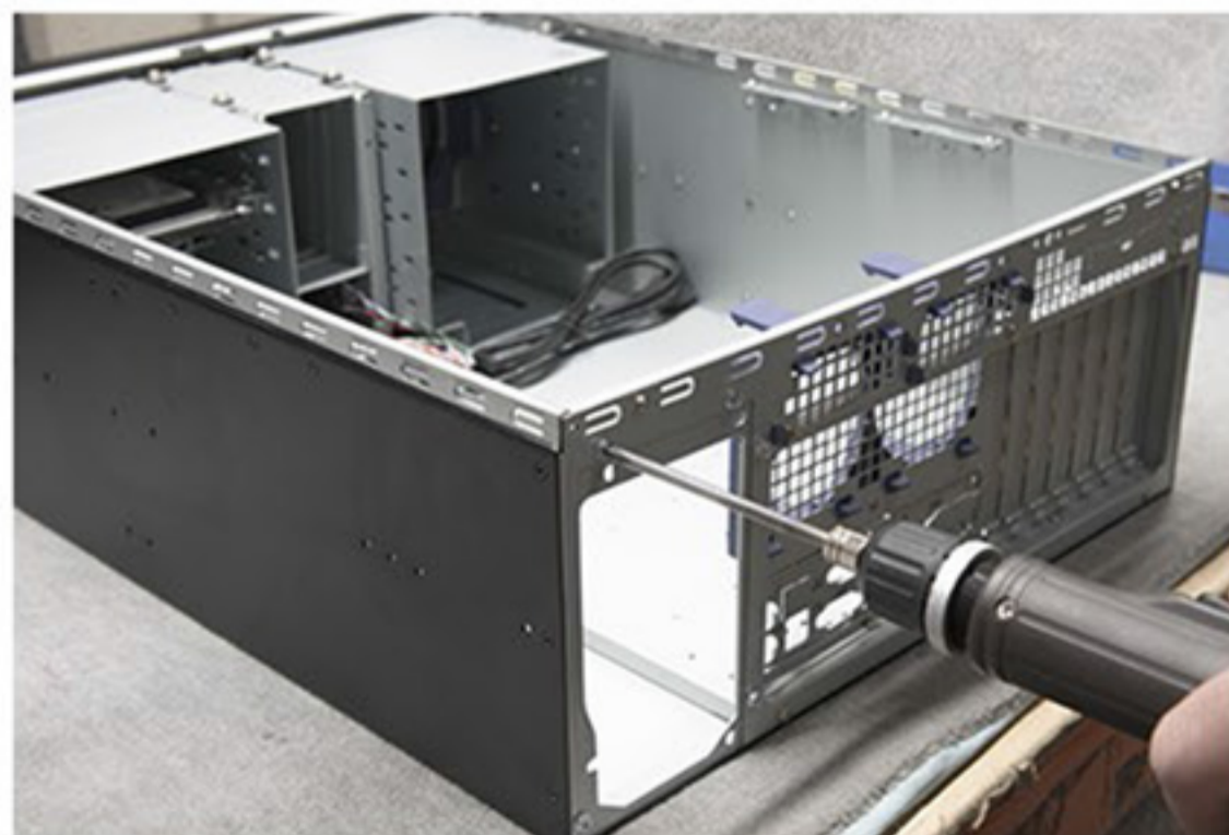
4. Remove the screws on the PSU bracket.