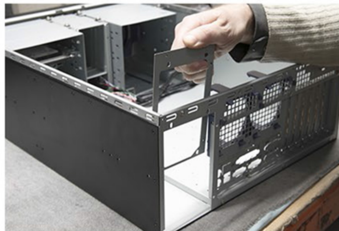
5. Remove the PSU bracket. (This bracket is only needed for an ATX PSU.)