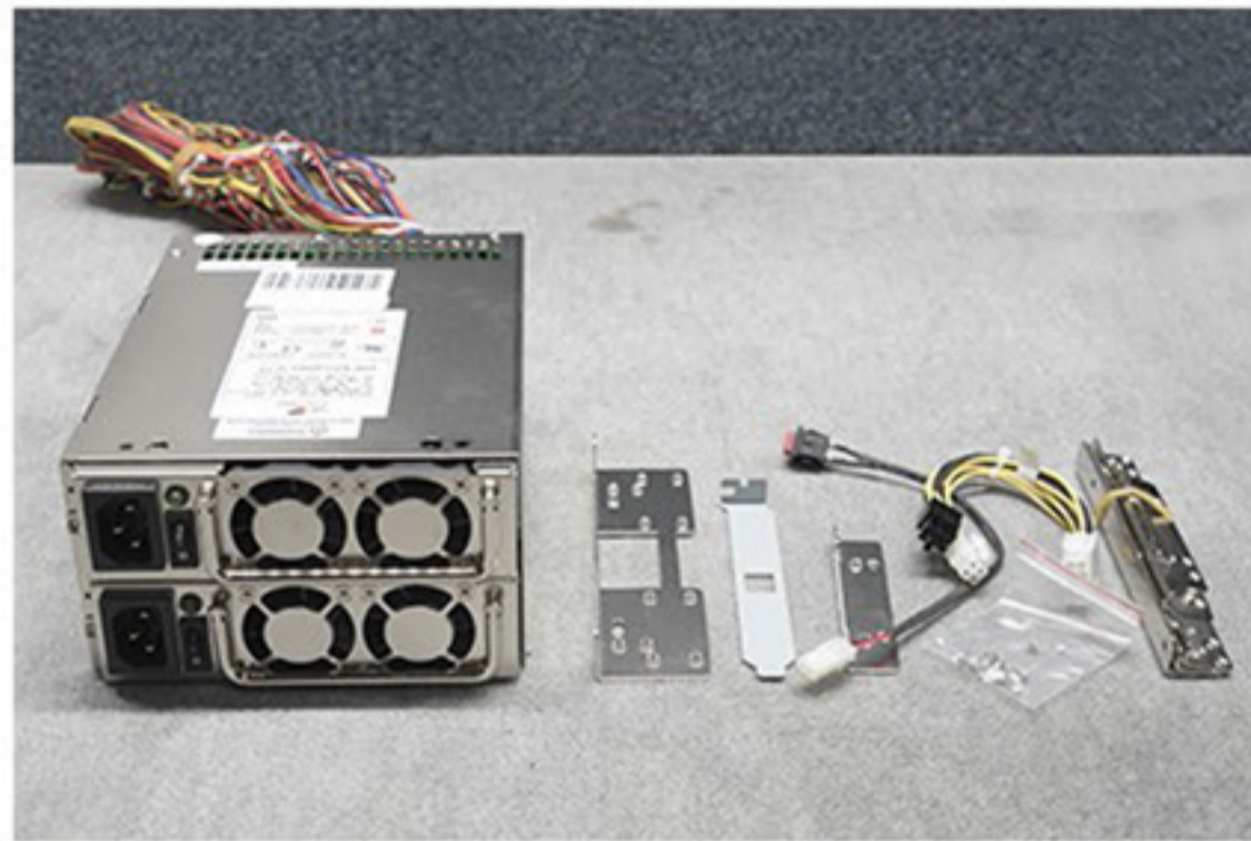
1. Here is an overview of all the accessories for the installation of a mini-redundant power supply (PSU) in UNC-411E-B.