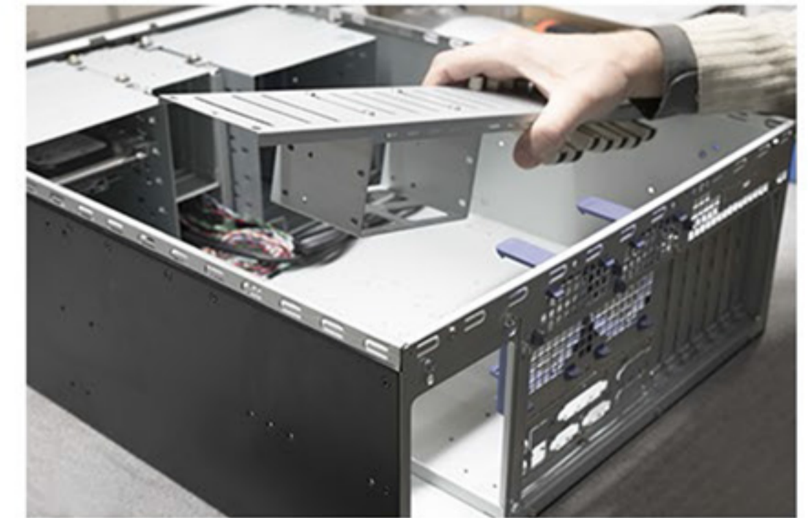
3. Remove the hard drive cage (HDD) cage.