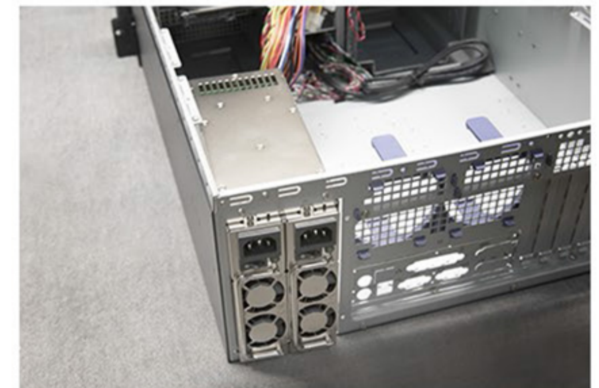
6. Install the mini-redundant PSU in place, as shown in the picture.